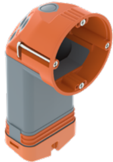
Type: HE 74-L Item no.: 2003828